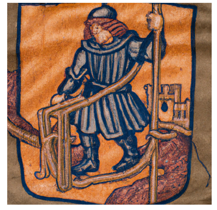
"Locator Dressed as a Knight Marking Underground Utilities" - Medieval style tapestry

Banner Image: "Vibrant portrait painting of Salvador Dalí with a robotic half face." Credit: OpenAl