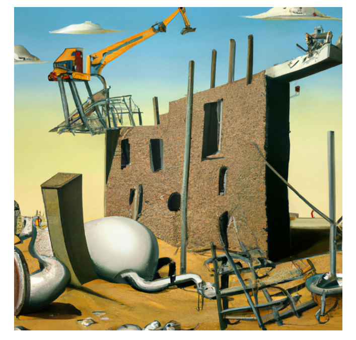
"Construction Site" Painting - Style of Salvador Dali