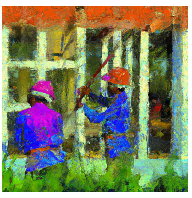
"Construction Workers Building a House" Impressionist Painting - Style of Monet