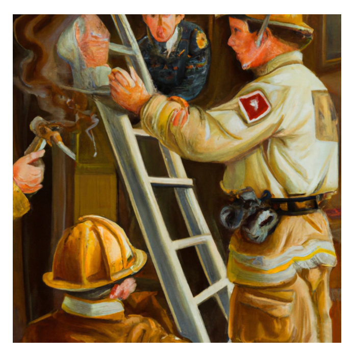
"Passion to Serve, Dedication to Safety" Oil Painting - Style of Norman Rockwell

I had the pleasure of gaining access to DALL-E and immediately began to enter a host of descriptions and information to see what the model could accomplish. I was impressed with many of the images it generated. The following are some images in various mediums, with some tied to the style of specific artists, to demonstrate how DALL-E created images based on text related to our industry. The text entered to inspire DALL-E is included below each image.