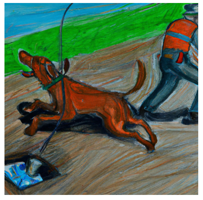
"Locator Chased by Dog While Locating Underground Utilities " - Oil Pastel