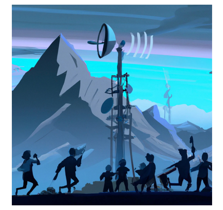
"Broadband Network Connecting People Across a Vast Landscape" - Digital Art