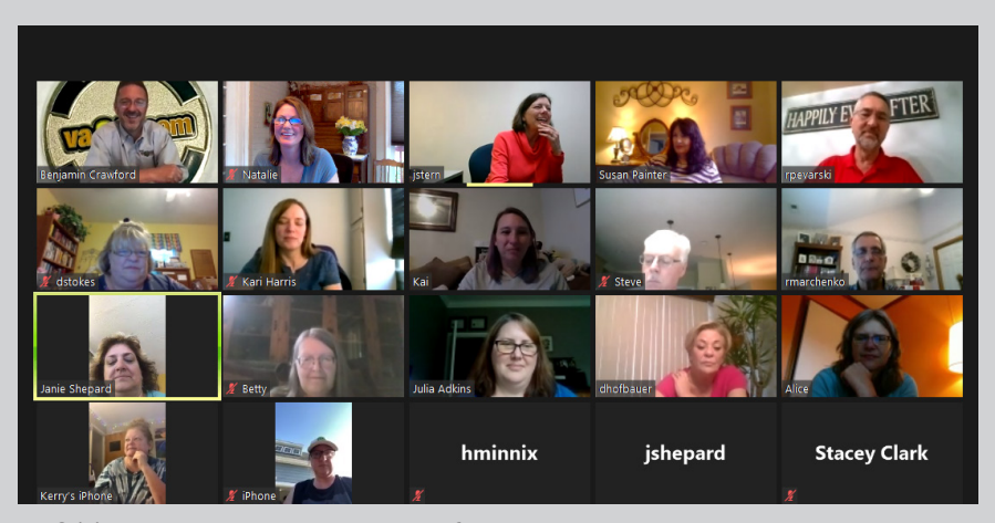
VA811 team members have some fun during a virtual hangout.