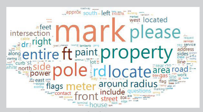
Word Cloud created by SAIG to illustrate the more heavily used words in web ticket entry.

Collectively, the near completion of Phase I and the work being done as part of Phase II represent a major step toward helping SAIG begin to create an auditing algorithm that will result in 100% of web tickets being audited. An interesting finding during this analysis of the web tickets is that one of the most used words in the excavation area description on web tickets is the word "Please." This is reflected on a Word Cloud SAIG created to illustrate the more heavily used words. So, what can we learn from this? Something we already knew: the excavation community is incredibly polite! But now we have some data to prove it!